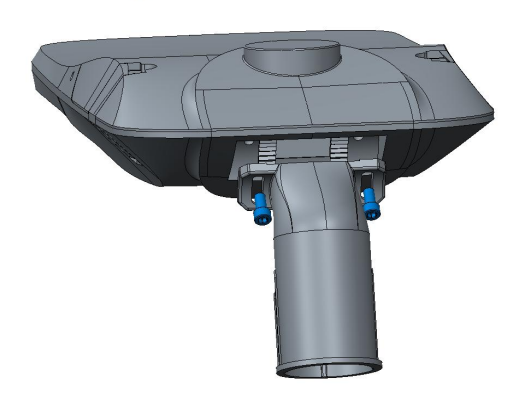
Step1-Remove the screws